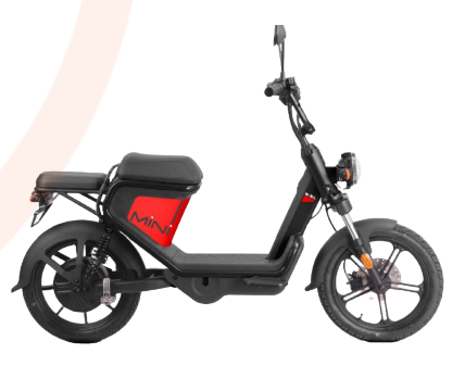
More colours available